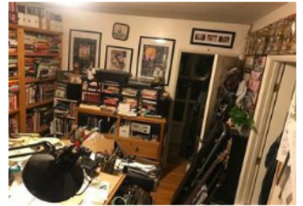
BR 3 office