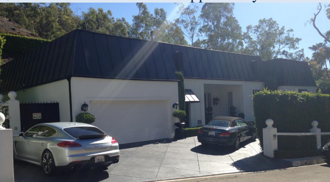
1126 Chantilly Road, Los Angeles, CA 90077

$1.15 Mil 1st Trust Deed Opportunity @ 8.50%