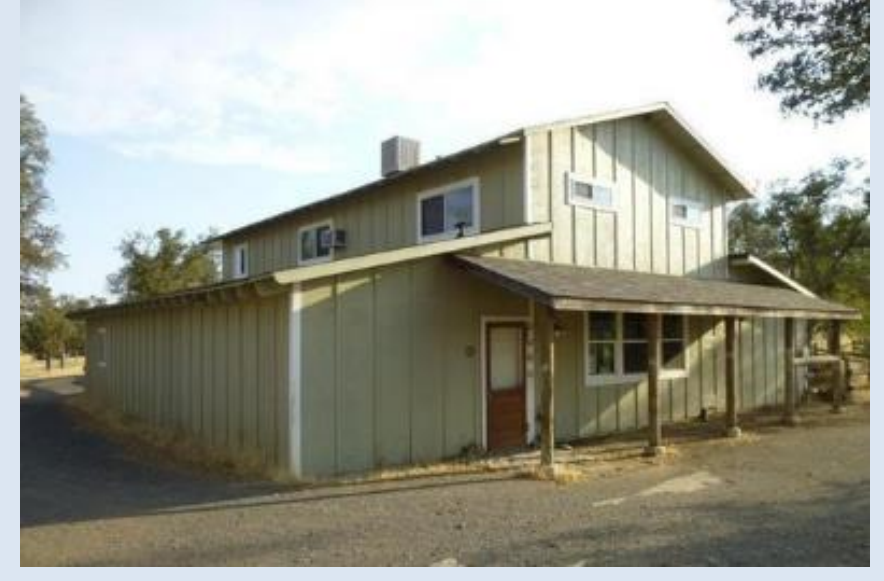
8995 Old Don Pedro Road, Jamestown, CA 95327

$188,500 1st Trust Deed Opportunity @ 10.00%