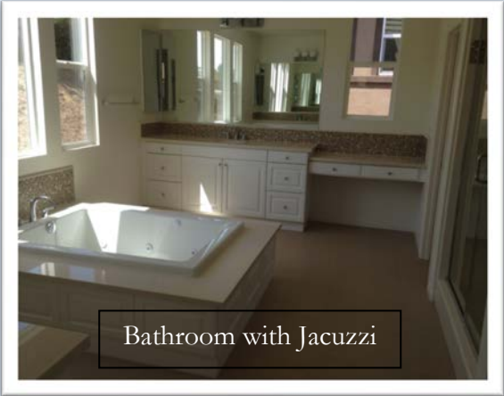
Bathroom with Jacuzzi